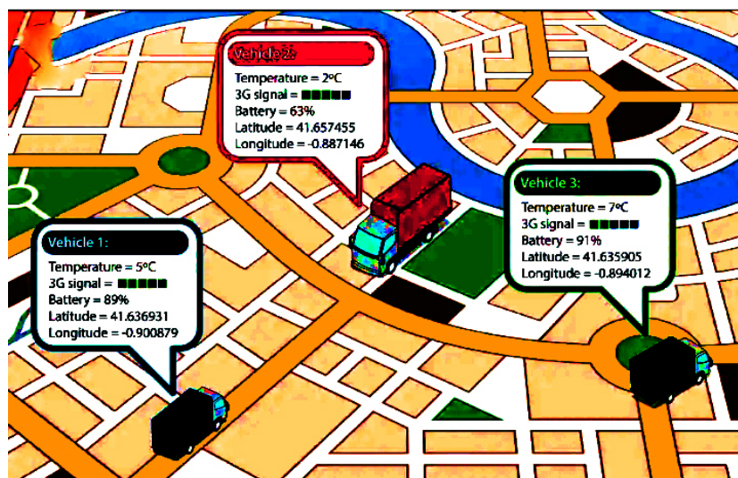
Fig 6.1 Boulders Management System

2. In future it will implementing in many projects.