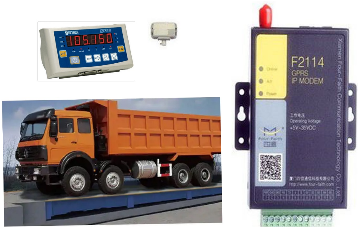
Fig 1.1 Weigh Bridge